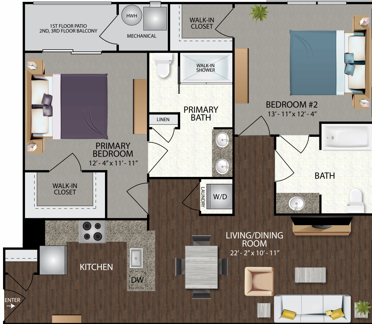
2nd, 3rd Floors